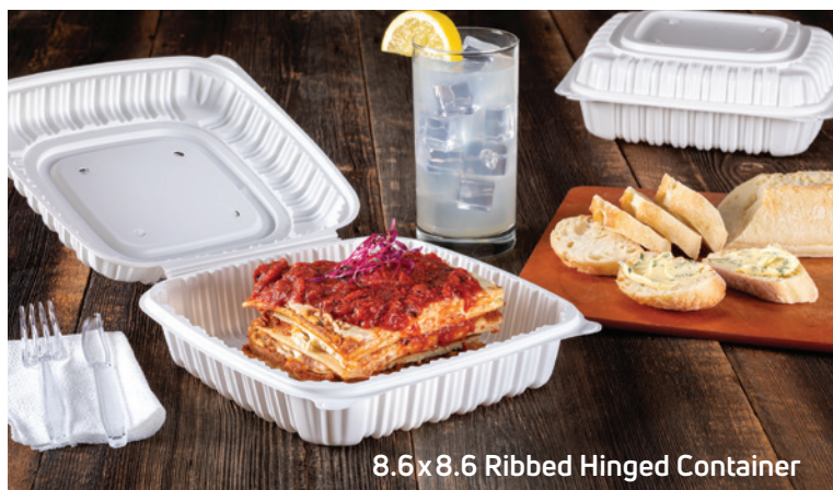
8.6x8.6 Ribbed Hinged Container