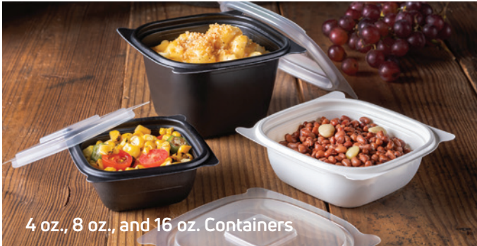
4 oz., 8 oz., and 16 oz. Containers