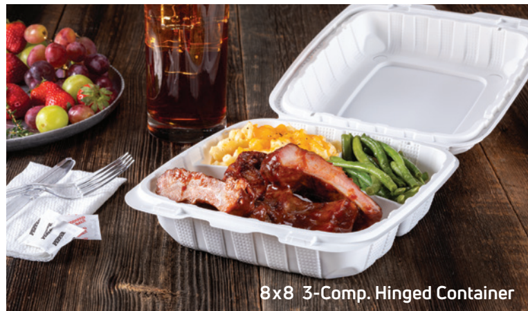
8x8 3-Comp. Hinged Container