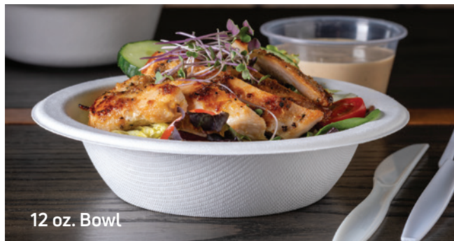
12 oz. Bowl