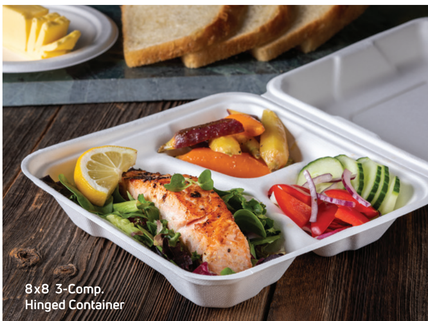
8x8 3-Comp. Hinged Container