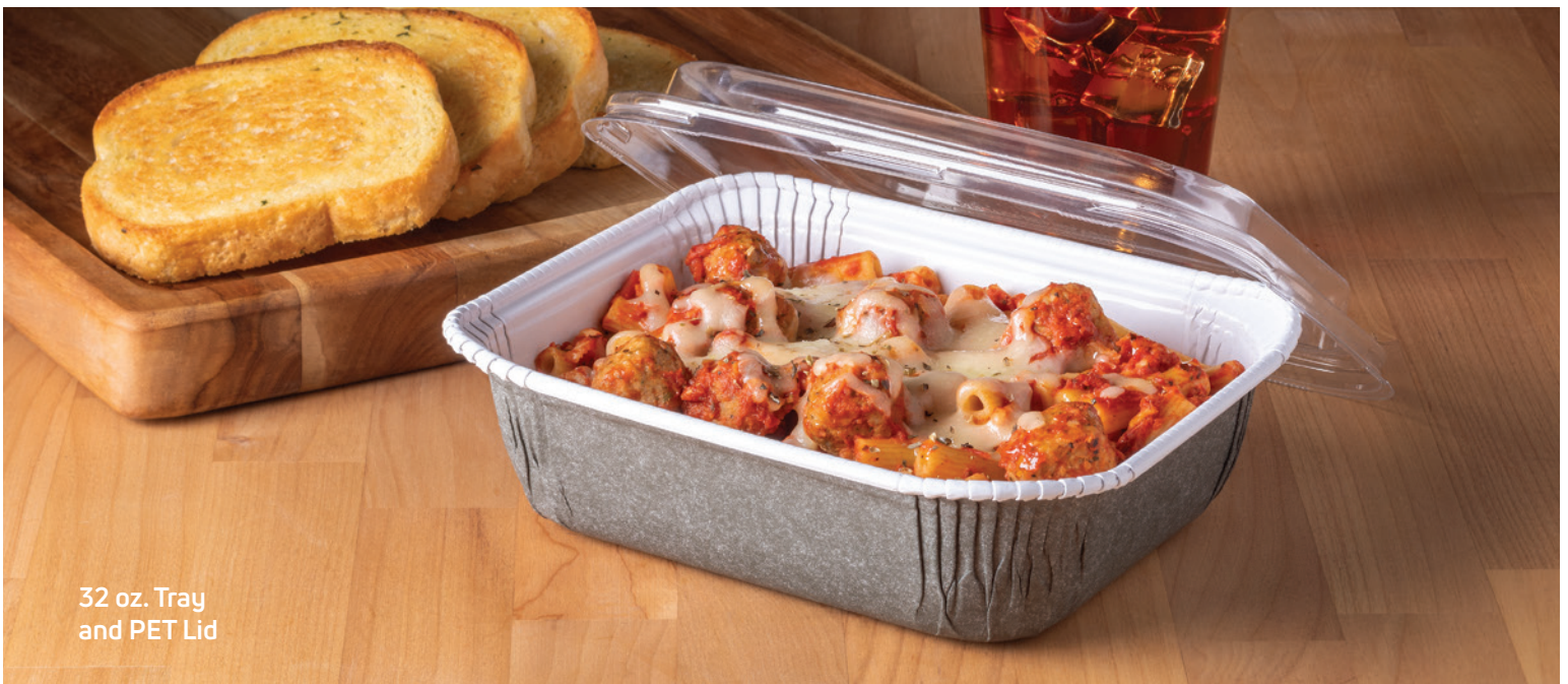
32 oz. Tray and PET Lid