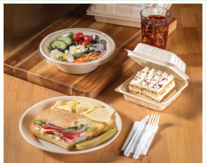
Plates, Hinges and Bowls