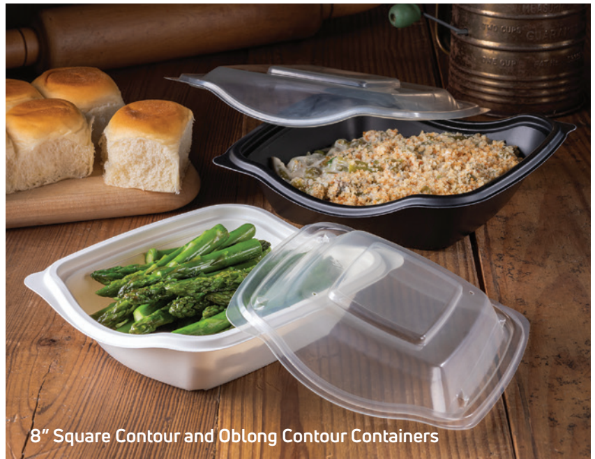
8" Square Contour and Oblong Contour Containers