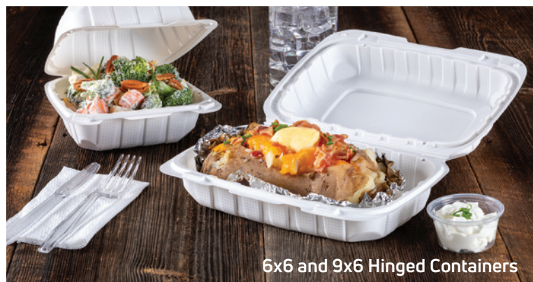
6x6 and 9x6 Hinged Containers