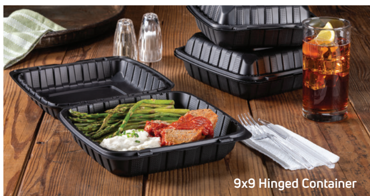
9x9 Hinged Container