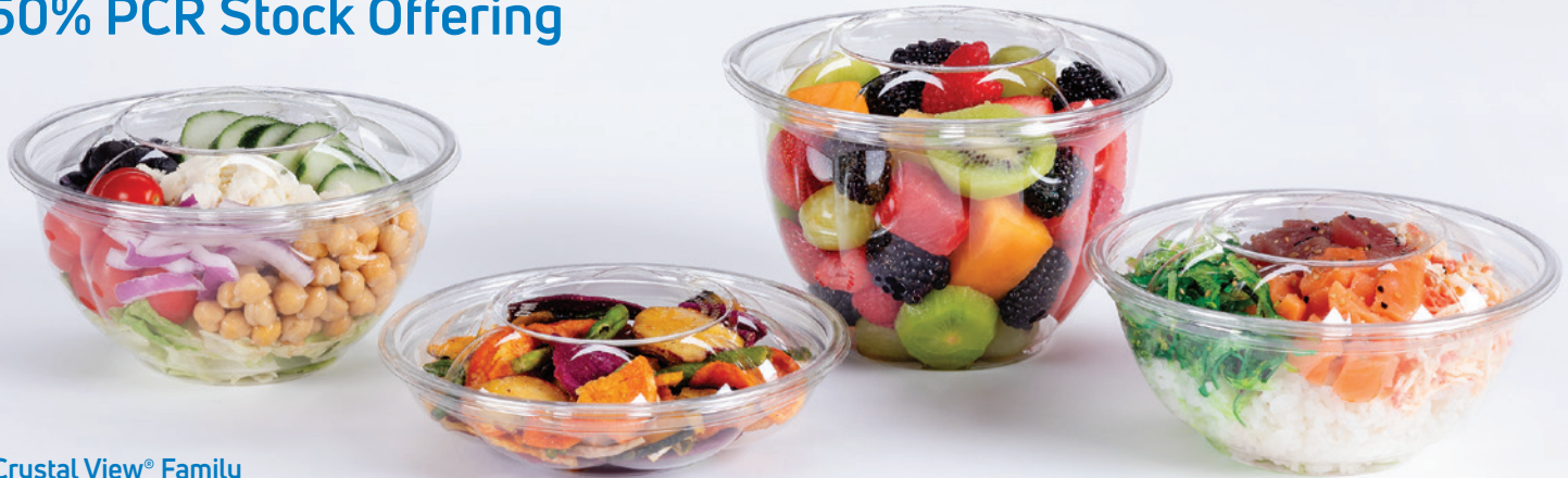
Crystal View® Family