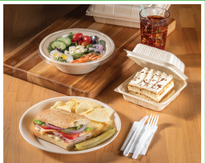
Plates, Hinges and Bowls