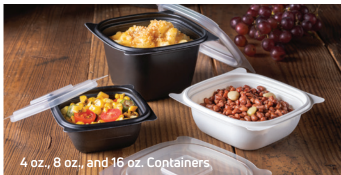
4 oz., 8 oz., and 16 oz. Containers