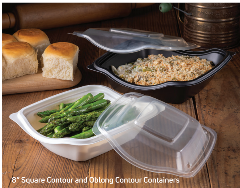
8" Square Contour and Oblong Contour Containers