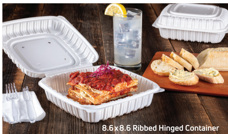
8.6x8.6 Ribbed Hinged Container