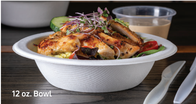
12 oz. Bowl