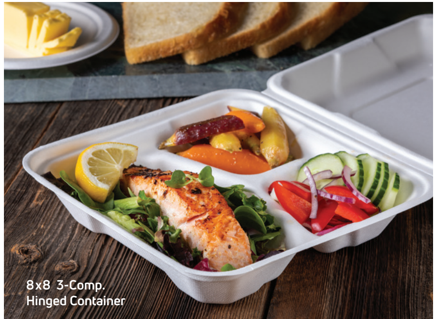
8x8 3-Comp. Hinged Container